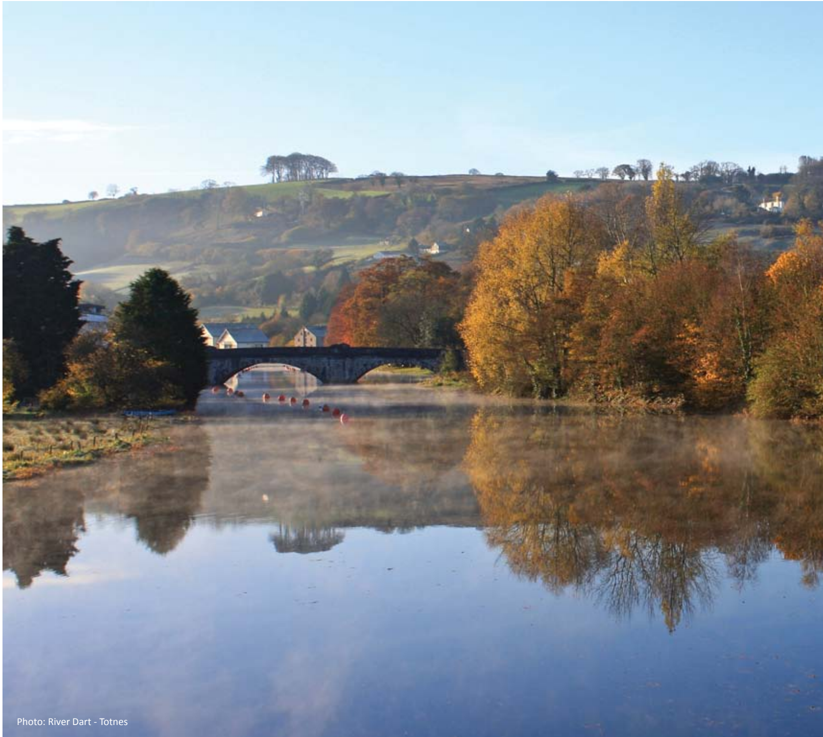
Photo: River Dart - Totnes